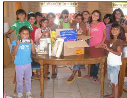
Little girls with house mom receiving a box of donated food

On behalf of all the innocent children whose lives have been forever changed because of your kindness, thank you!